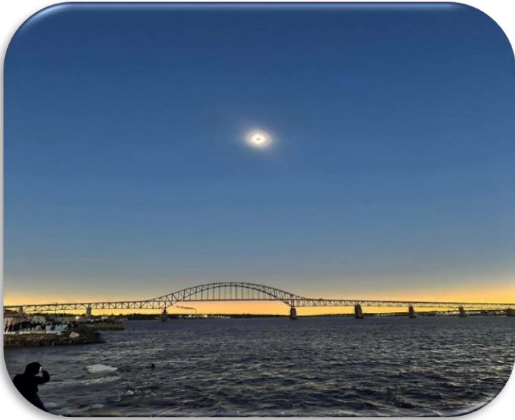
Eclipse ‘God’s Wonders’

“St. Andrew’s United Church is a Christian community of faith that shares Christ’s love through worship, fellowship, spiritual growth, and outreach.”